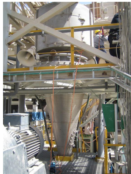
Wet-Vortex installed at Rotem Amfert Negev crushing plant