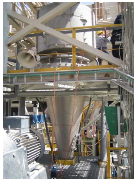
Wet-Vortex installed at Rotem Amfert Negev crushing plant